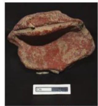
கீழ்நாடி அகழாய்வில் புதன்கிழமை கண்டெடுக்கப்பட்ட சுடுமண் பாம்பு தலை உருவம்.